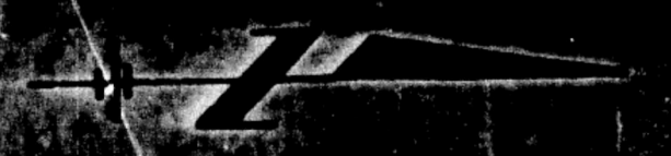
EXHIBIT "A" CITY OF GRAND ISLAND, NEB T.W. JAMES - 512176 SCALE: 1" = 50'

78-0117500 City of Grand Island, Nebraska Planning Department 1000 North 12th Street Grand Island, Nebraska 68801 402-339-2000